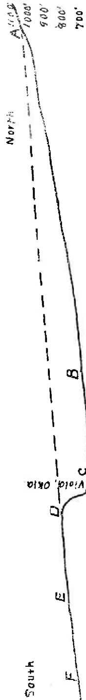
A. STREAM PIRACY: Map of the Headwater Drainage of Delaware and Sandy creeks.